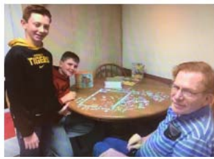
Sixth grade students visit residents at Tipton Manor as part of their Life Skills Guidance Lessons

Guidance Curriculum -The Tipton Elementary School Counselor has Life Skills/Guidance Class once a week for 30 minutes in each classroom. In these classes, three important main areas are addressed; 1.Academic 2. Personal/Social Emotional Health 3. Career Development.